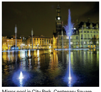
Mirror pool in City Park, Centenary Square,