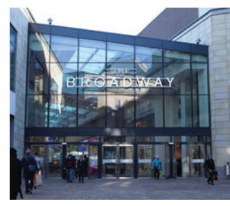
Broadway Shopping Centre in Bradford